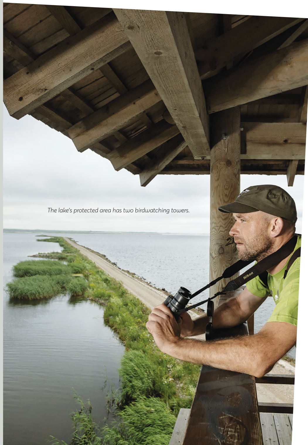
The lake's protected area has two birdwatching towers.

The lake has 15 islands with a total area of 36 ha. The shoreline is 44.6 km long. The lakebed is mostly covered by a layer of mud. More than 15 species of fish live here.